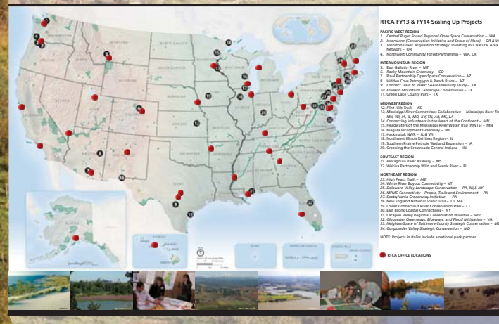
Salmon Creek Greenway, Vancouver, WA. Within The Intertwine Alliance's focus area, this 130-acre urban greenway includes bottomlands, wetlands and forested hillsides on both sides of Salmon Creek. It is extensively used by local wildlife, including migratory waterfowl and other birds, deer, coyotes, rabbits, opossums, raccoons and beavers. A 3-mile multi-use trail extends through a portion of the greenway.

Rivers, Trails, and Conservation Assistance program staff work in every state, the District of Columbia and Puerto Rico. RTCA projects lead to tangible on-the-ground success while building capacity to sustain locally based conservation.